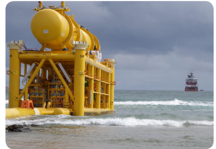
Towhead launch at Wester