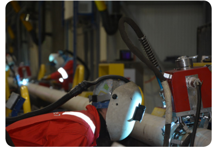
A total of 112km of pipe will be welded on the Catcher project